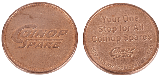
Red Copper Token in Natural Color