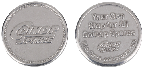
Brass Token in Silver Color