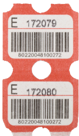
25.4 x 29.2x0.25mm Redemption Ticket