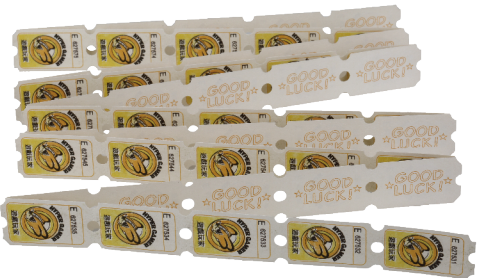
Redemption Ticket with Consecutive Number