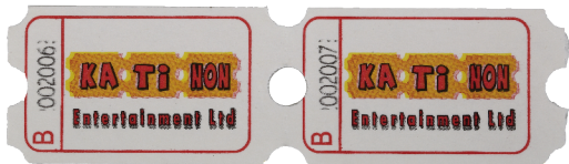
50.8 x 29.2x0.25mm Redemption Ticket

Packing: 2000pcs in a pack,50 packs (100,000pcs) to an export carton.