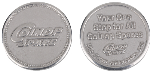
Stainless Steel Token in Natural Color

The material to make tokens can be stainless steel, brass, zinc alloy, iron, red copper, nickel silver, and so on. We also develop bi-metal tokens, mid-hole tokens colored tokens, etc.