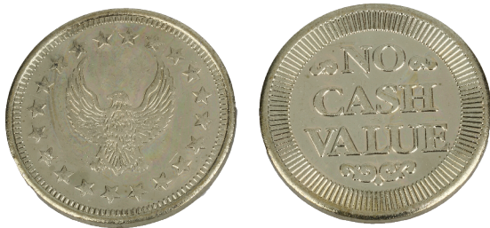
Nickel Silver Token in Natural Color