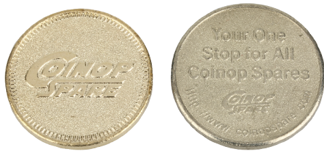
Brass Token in Gold Color