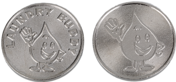
Zinc Alloy Token in Silver Color